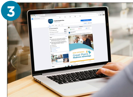
Social Media Posts (Folders explained below)