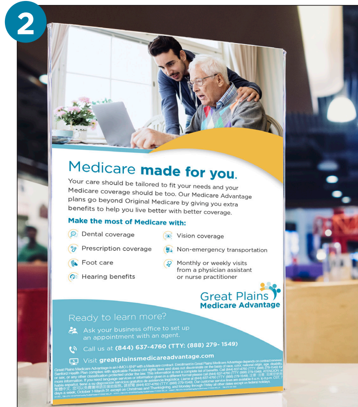
Member-Facing GPMA Poster (PDF)

There are two folders that will help you to promote GPMA. These folders are titled — “Benefits” and “Team” . Within the folders are two documents: